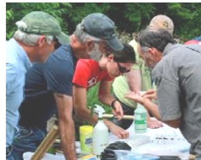
Workshop participants identify and count macroinvertebrates gathered from the Jackson River.

The committee is presently working to assemble all the available water quality and biological data for Highland streams. Data sources include regulatory and natural resource agencies, universities and conservation organizations. The assembled data, together with general information on surface water management and assessments, will be made available to the public on the HRD website. By providing access to information, the committee hopes to support the environmental stewardship interests of landowners and residents.